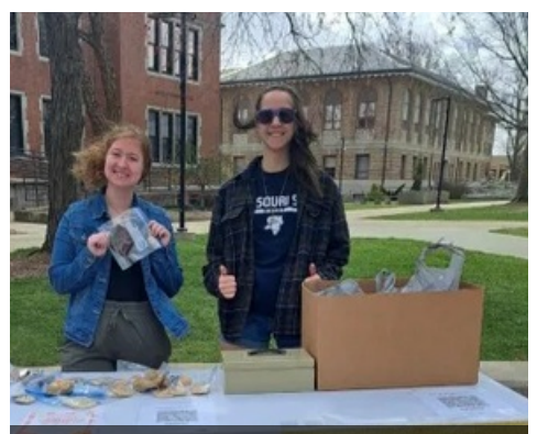
Students sell baked goods to support A Simple House in KC.

May God richly bless you during this Easter season and throughout the year!