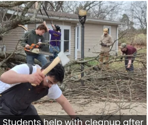
Students help with cleanup after the March tornado in Rolla.